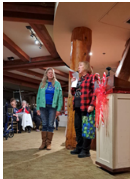
INSTALLATION OF OFFICERS AND PRESIDENT'S GIFTS