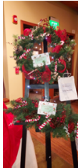
SPECIAL RAFFLE ITEMS